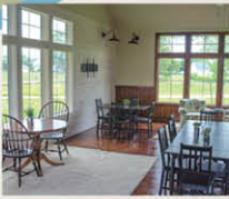
MEETING ROOM AND OUTDOOR PAVILION